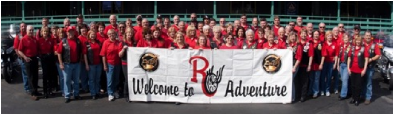
Gold Wing Road Riders Association Chapter CA-1R - South Orange County, CA